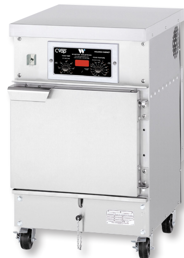
HA4002 CVAP® HOLDING CABINET HALF SIZE, UNDER COUNTER MODEL, FANLESS Electronic Differential Control

CVap equipment complies with domestic and international requirements such as UL, C-UL, UL Sanitation, CE, MEA, and others.