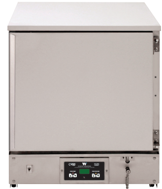
HC4009 CVAP HOLDING CABINET Electronic Differential Controls

HALF SIZE, UNDER COUNTER MODEL FANLESS (SHOWN)