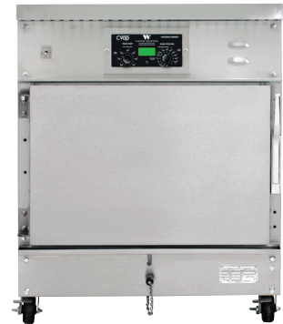
HA4507 CVap Holding Cabinet Electronic Differential Control

HALF SIZE UNDER COUNTER MODEL WITH FAN (SHOWN)