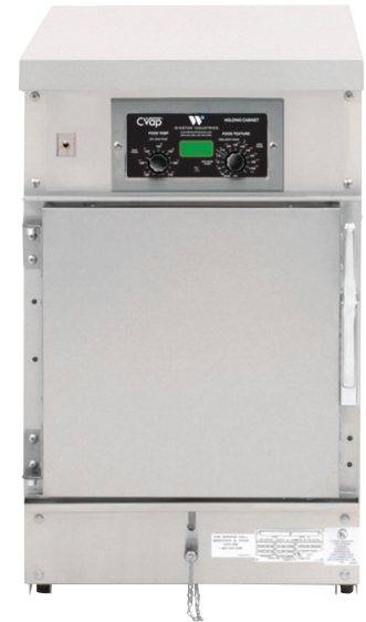
HA4503 CVap Holding Cabinet Electronic Differential Control

HALF SIZE UNDER COUNTER MODEL WITH FAN (SHOWN)