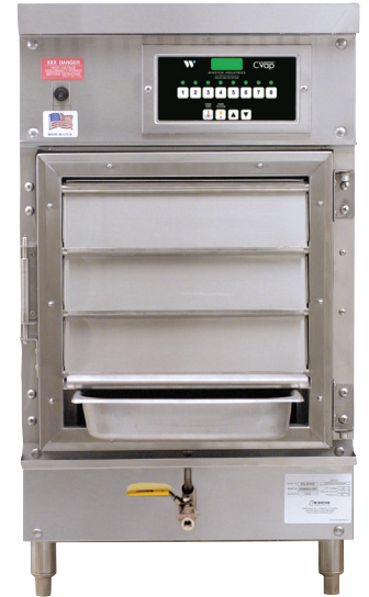
HA8503-04 CVAP UNIVERSAL HOLDING BIN CABINET Electronic Differential Control

Allow at least 2" (51 mm) clearance on sides, particularly around ventilation holes. Allow at least 18" (457 mm) clearance from heat producing equipment, such as ovens or fryers. Generally this equipment does not need to be installed under a mechanical ventilation system (vent hood). Check local health and fire codes for requirements specific to your location. Unit must be installed at level.