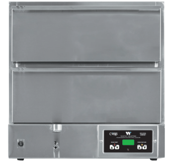
HBB0D2 CVAP HOLD/SERVE DRAWER Electronic Differential Controls