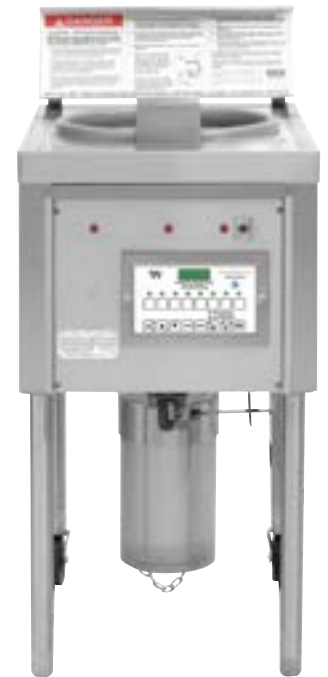
OF49C & OF59C Collectramatic® Open Fryer 8-Channel Programmable Controls

Installation Requirements Ventilation required. Check local codes.