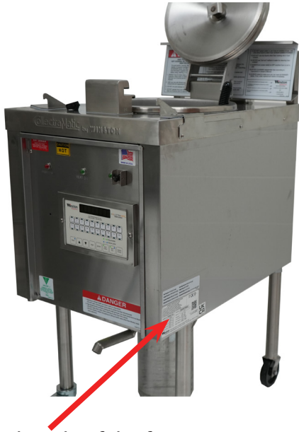
1. Right side of the fryer