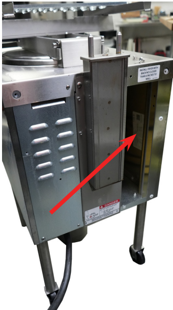
3. Inside the right rear panel.