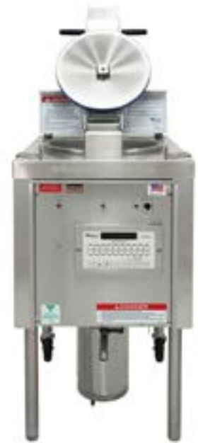
LP46 & LP56 COLLECTRAMATIC® HIGH EFFICIENCY FRYER 20-Channel Programmable Controls

Installation Requirements Ventilation required. Check local codes.