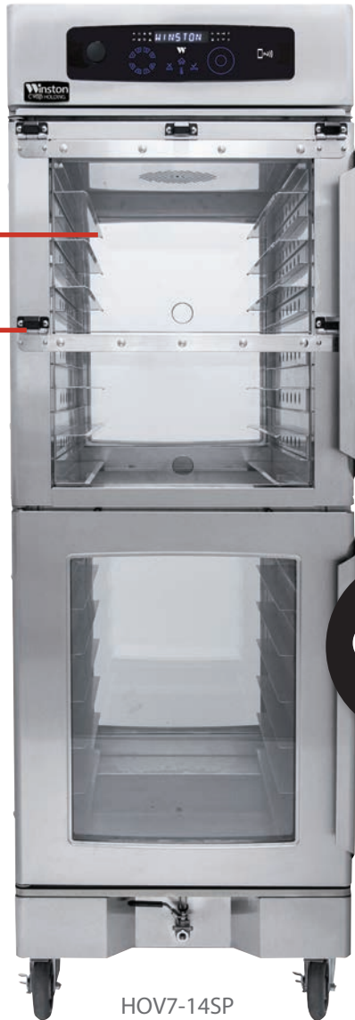
HOV7-14SP (Shown with optional flip doors and pass- through.)

CVap gives you consistent food quality. Our flip door cabinets allow you to pack from the front while keeping food hot.