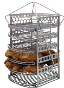
Multiple Basket Configurations