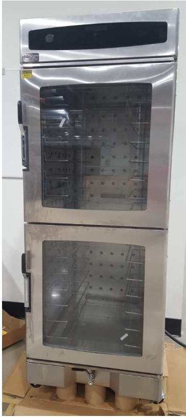
Figure 1. Representative Sample