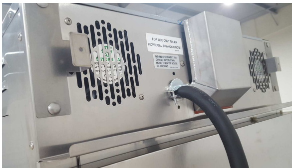
Figure 3. Rear Exhaust Fans