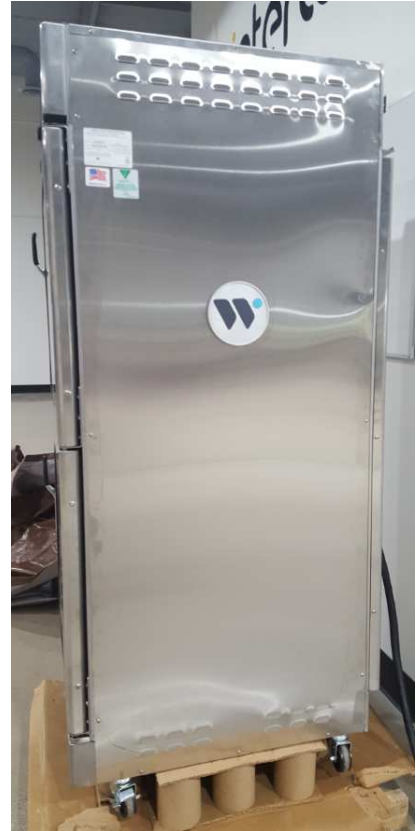
Figure 2. Side View