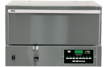
HBK5D1 CVAP HOLD/SERVE DRAWERS 8 Timer Electronic Controls